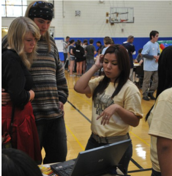
Boulder High School CYBOR presentation at the annual event