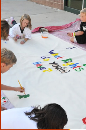
Annual Event October 15, 2011

More than 100 children and youth participated in the GUB annual event on October 15 at the North Boulder Recreation Center. It included student presentations, youth hip hop performances, creation of a mural about youth rights, free food, raffle prizes and bouncy house games. Those attending said that the event was engaging enough for them to come again next year.