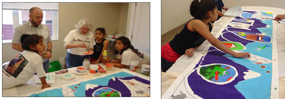
Figure 1. “Dreamers” and the facilitating artist painting a banner in the after school program at Manhattan Middle School.

to draw pictures. The artist then compiled their ideas and drawings into a single banner, which the youth painted (Figure 1). Youth were surprised and excited by this project because no one had ever asked them questions about their community before. It gave them an opportunity to reflect about their community and themselves and see that people valued their culture and ideas. The murals hung in the Boulder Museum of Contemporary Art, the Boulder Creek Festival, and several GUB events.