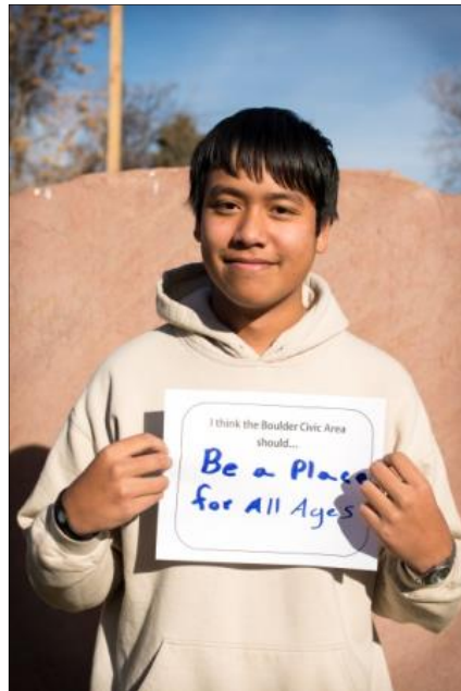
Figure 14. An AVID student with his vision for the Boulder Civic Area to “be a place for all ages”.

there. Youth repeatedly expressed a desire for more places to hang out, both indoors and out. This desire was expressed by the Action Groups, the teen mothers, and in a variety of forms since. The Civic Area provided a perfect opportunity to not only assess existing conditions within Boulder, but also to begin to imagine a different world, one that would be welcoming to people of all ages and cultures (Figure 14). When youth were invited to reimagine this area in this way, they became engaged.