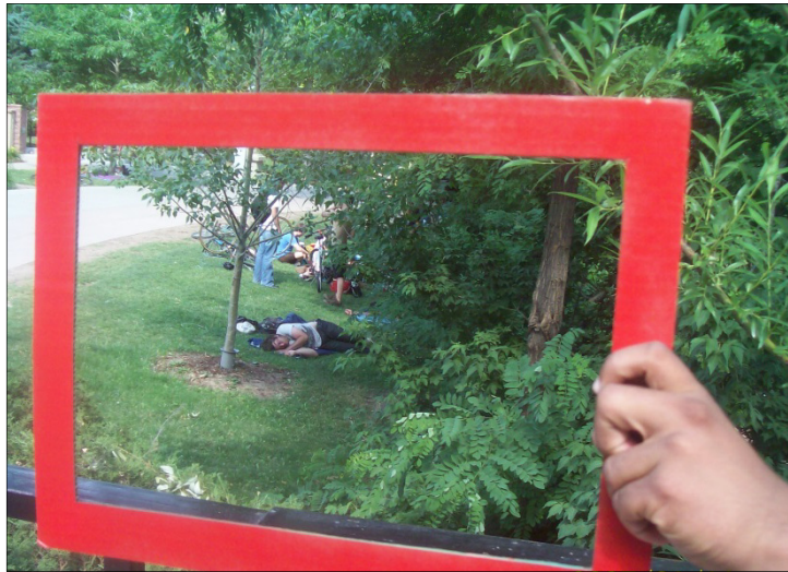
Figure 7. A “Dreamer” presenting results of the photovoice project at a public meeting for the Civic Area.