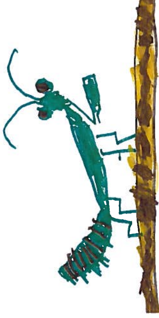
PRAYING MANTIS BY: BODEN