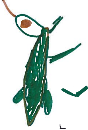
GRASSHOPPER BY: ASHI