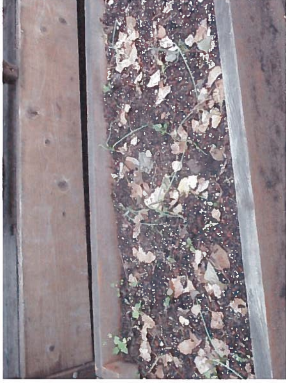
10. ON FLOWER BEDS IN THE GARDEN