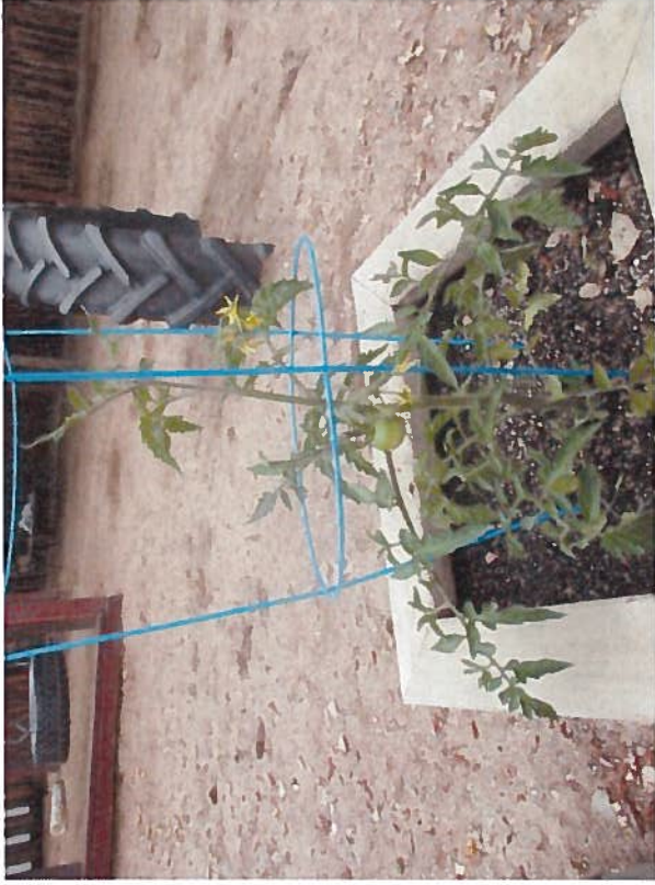
9. ON THE WATERFLUME TOMATO PLANTS